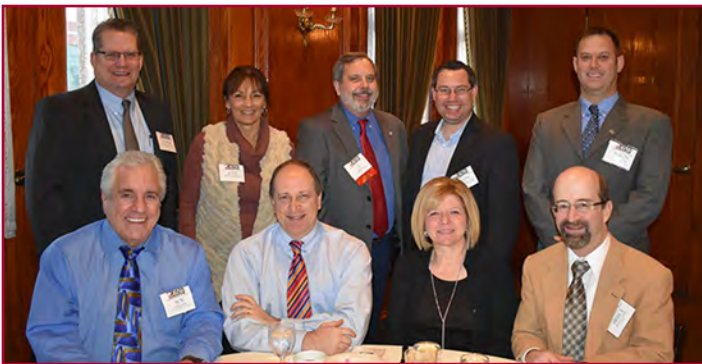
CISCO supporters network at Annual Meeting.